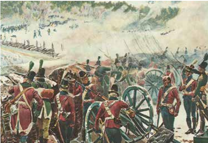
Scan10068 - Kopi.TIF

The fortification was built to protect the connection between Prestebakke and Berby and to stop movements from southern Enningdalen. Whether there were direct skirmishes in connection with the fortification is unclear, but it became a bone of contention between the Norwegian and Swedish forces in the war of 1808. This is proof of its strategic importance. Swedish forces, counting 1400 men, moved forwards across Vassbotten in April 1808. They immediately took control of Berby, Prestebakke and Ende fortification. When the Norwegian forces attacked Prestebakke on 10 June, mock and diversionary attacks were executed against Berby to draw attention away from Prestebakke. During these skirmishes the fortification was under the control of the Swedish forces.